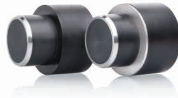
Shape adapted probes