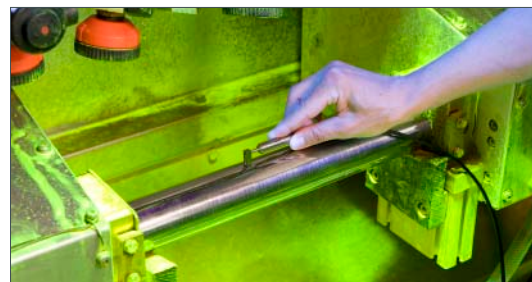
Example on application: Measurement of tangential field by means of the 90°-probe at field flow

For optimal adaptation to the geometrical conditions you can choose between a 0° and a 90°